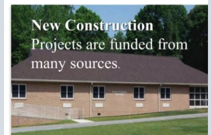
Lineberger & Udovich Dorms

Donors Building Naming Rights Build a Room Furnish a Room